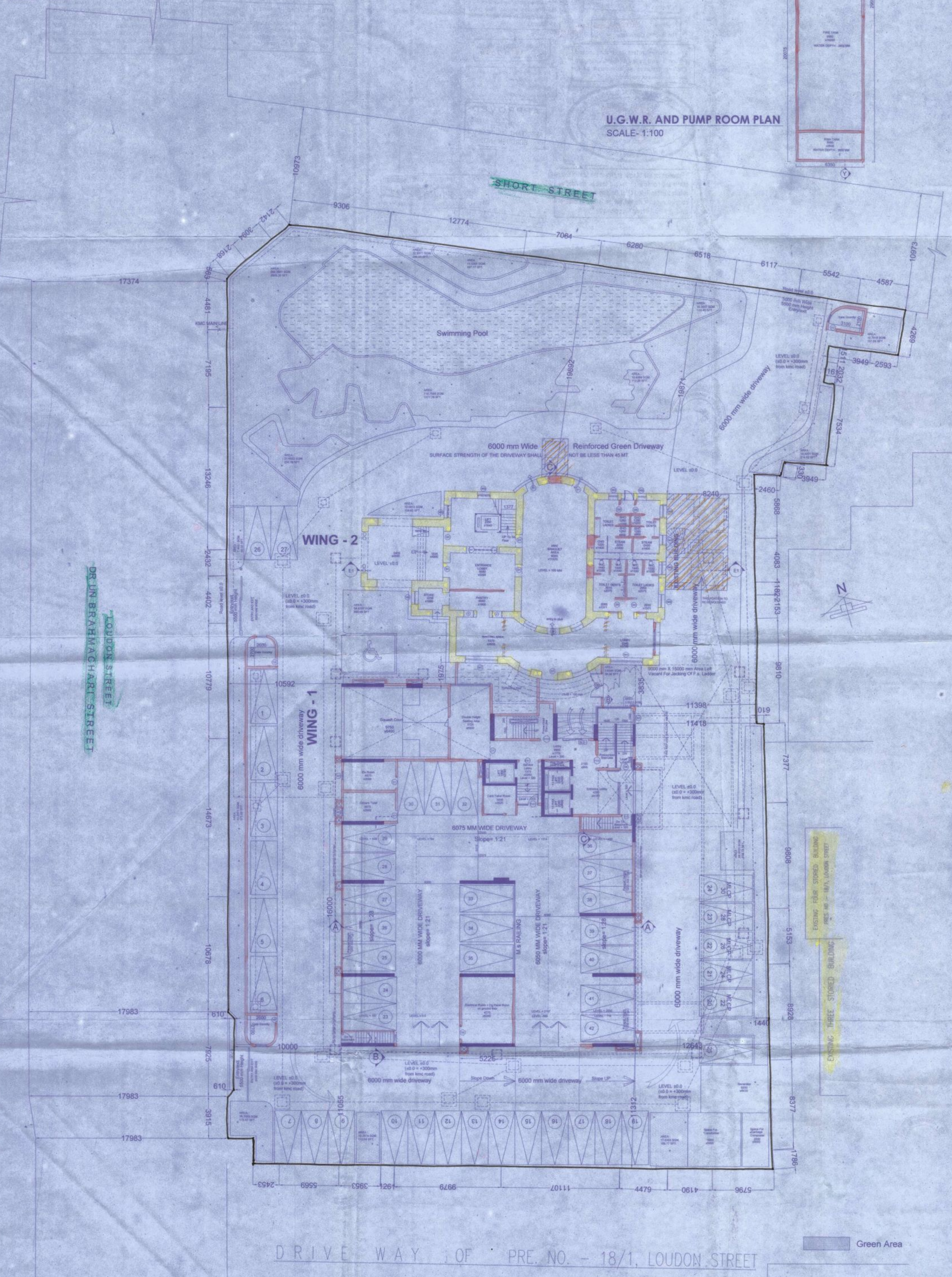
GROUND FLOOR PLAN SCALE: 1:150