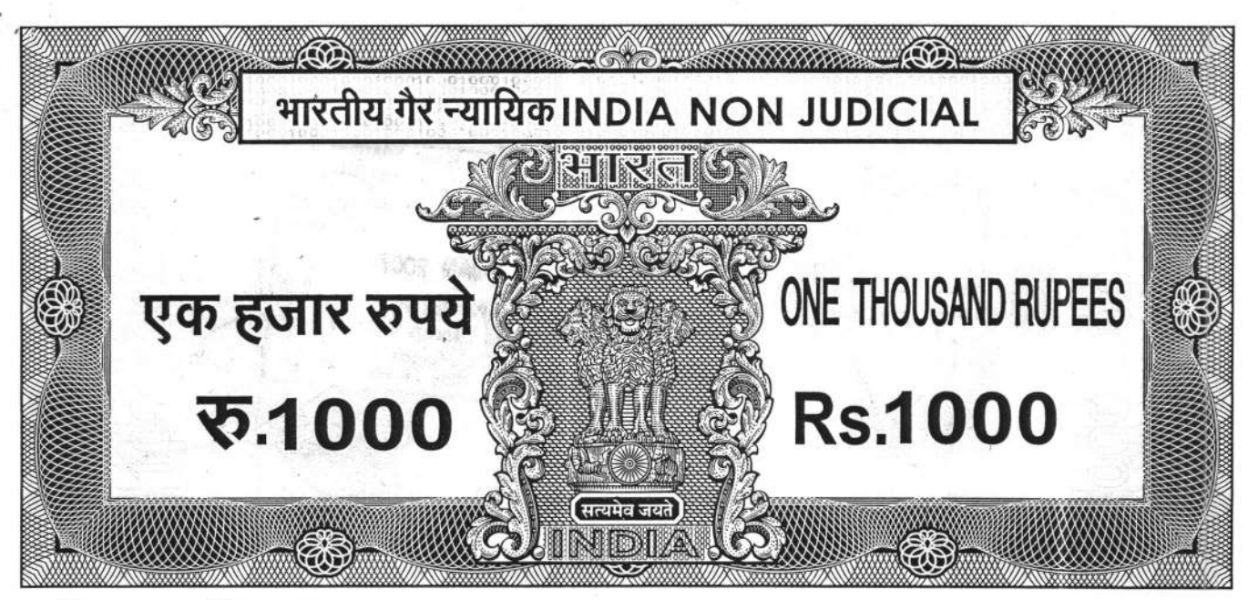
পশ্চিমবঙ্গ पश्चिम बंगाल WEST BENGAL

3.3 Carnival Tie-Up Private Limited , a company incorporated under provisions of the Companies Act, 1956, having its registered office at 7, Chitta Ranjan Avenue, Kolkata-700072