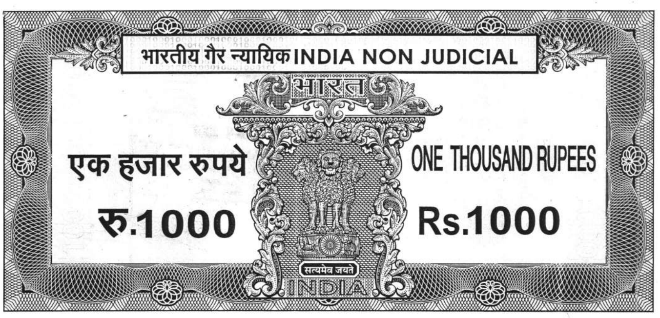
পশ্চিমবঙ্গ पश्चिम बंगाल WEST BENGAL

3.4 Mercy Vyapaar Private Limited, a company incorporated under provisions of the Companies Act, 1956, having its registered office at 7, Chitta Ranjan Avenue, Kolkata-700072