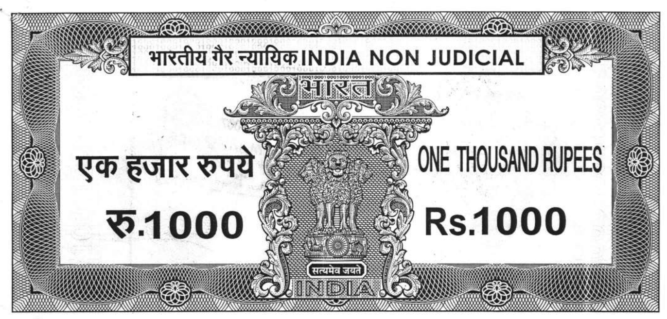
পশ্চিমবঙ্গ पश्चिम बंगाल WEST BENGAL