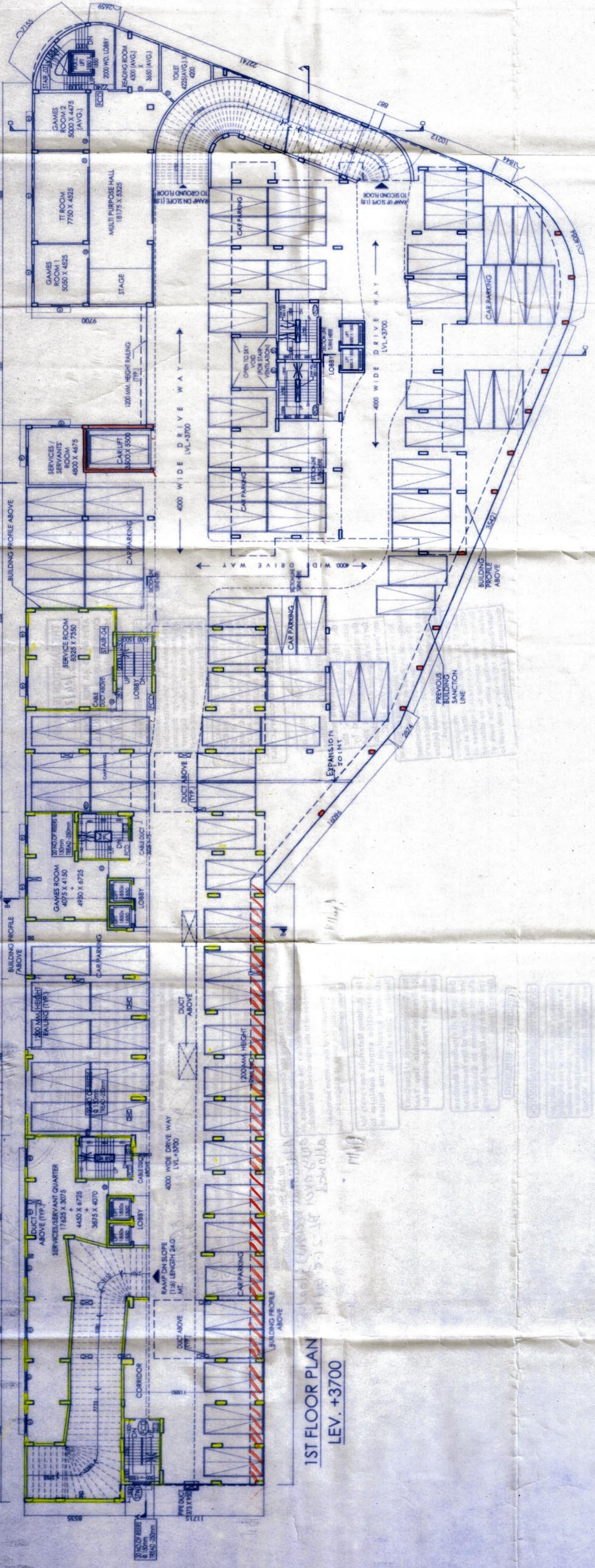
1ST FLOOR PLAN LEV. +3700

STRUCTURE SHOWN IN YELLOW TERN LINE ARE SANCTIONED & SHALL BE CONSTRUCTED. STRUCTURE SHOWN IN RED LINE ARE NOT SANCTIONED BUT PROPOSED FOR CONSTRUCTION. STRUCTURE SHOWN IN RED MARCH ARE NOT SANCTIONED BUT SANCTIONED AT 01/11/2016.