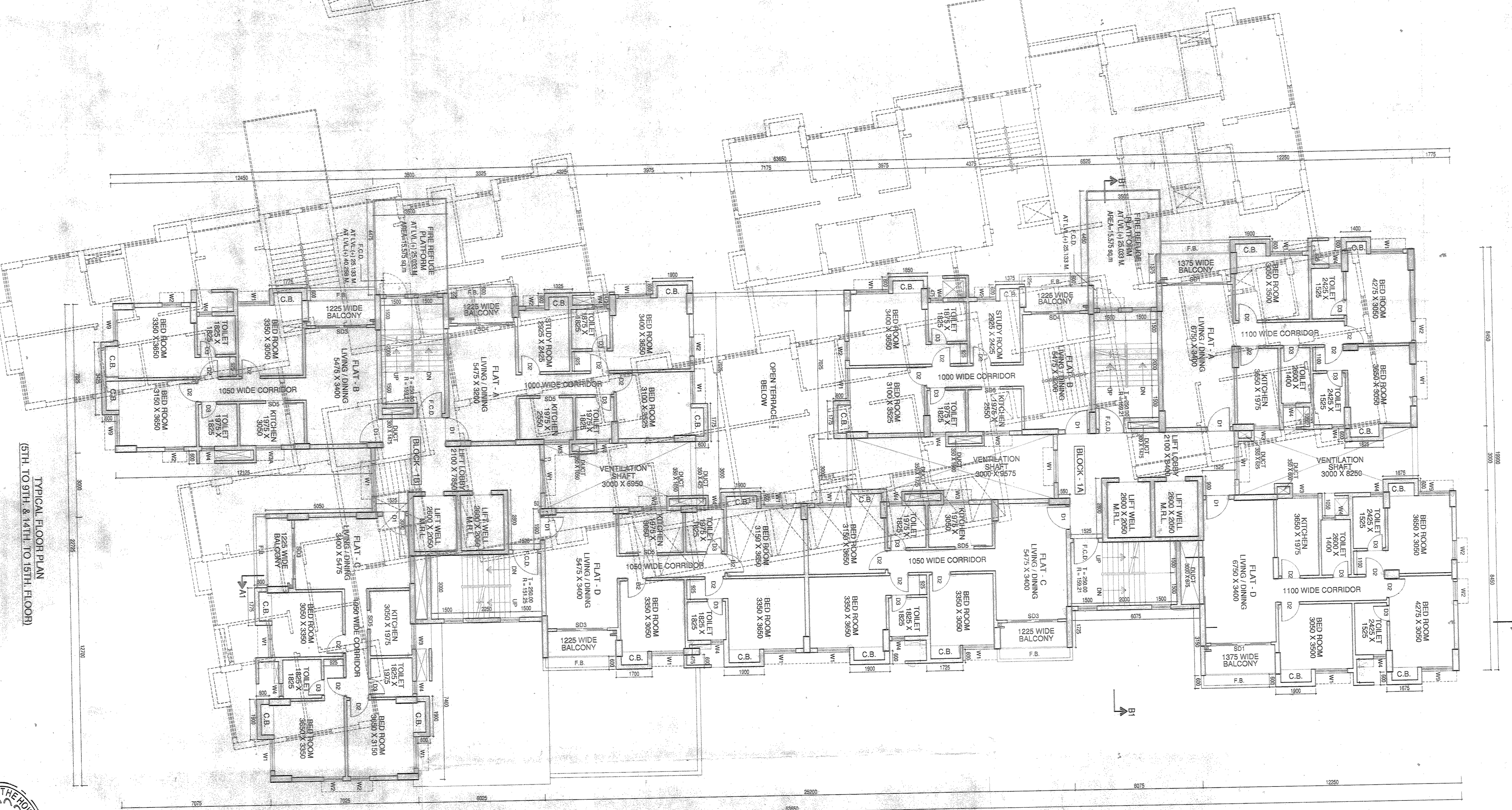
5TH TO 8TH & 14TH TO 15TH FLOOR TYPICAL FLOOR PLAN