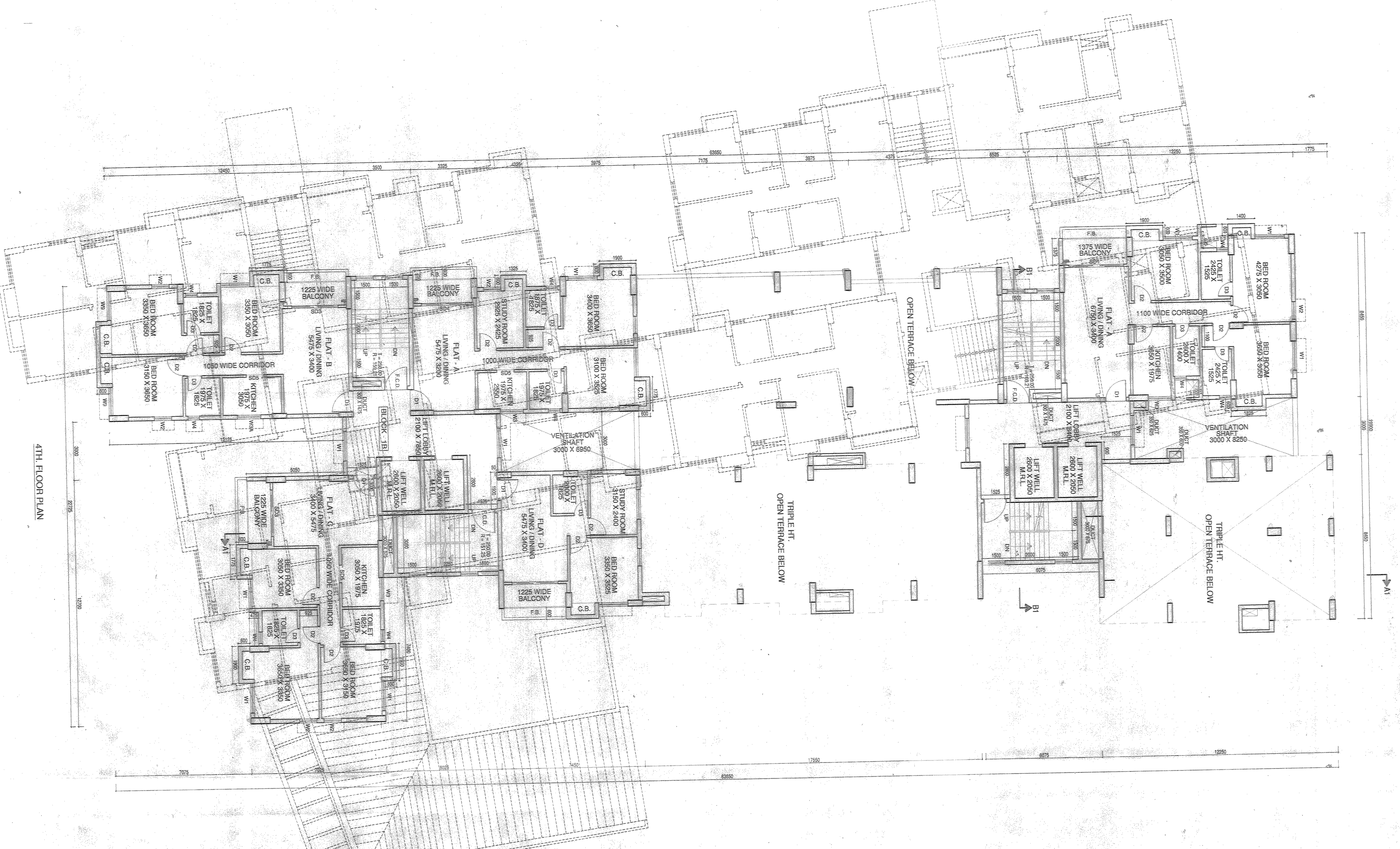
4TH FLOOR PLAN