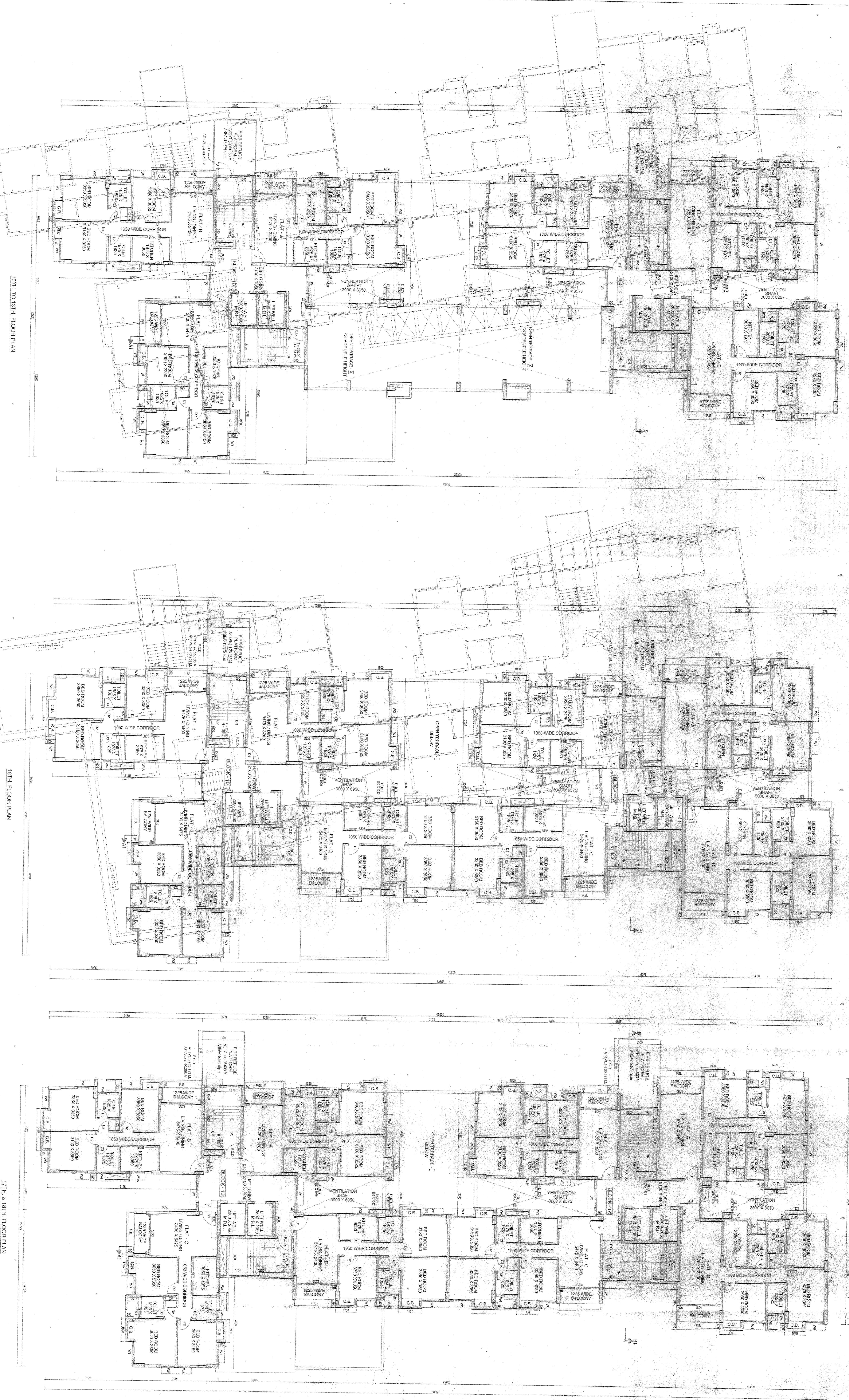
17TH & 18TH FLOOR PLAN