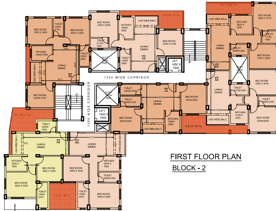
FIRST FLOOR PLAN BLOCK - 2