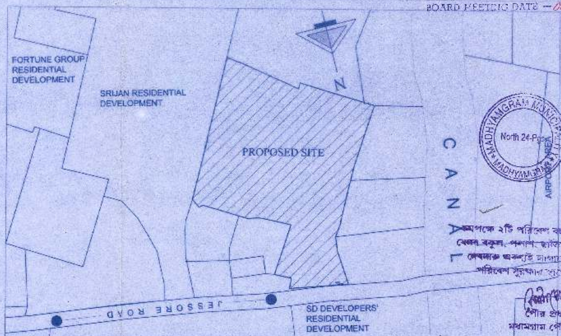
KEY PLAN Scale 1:4000