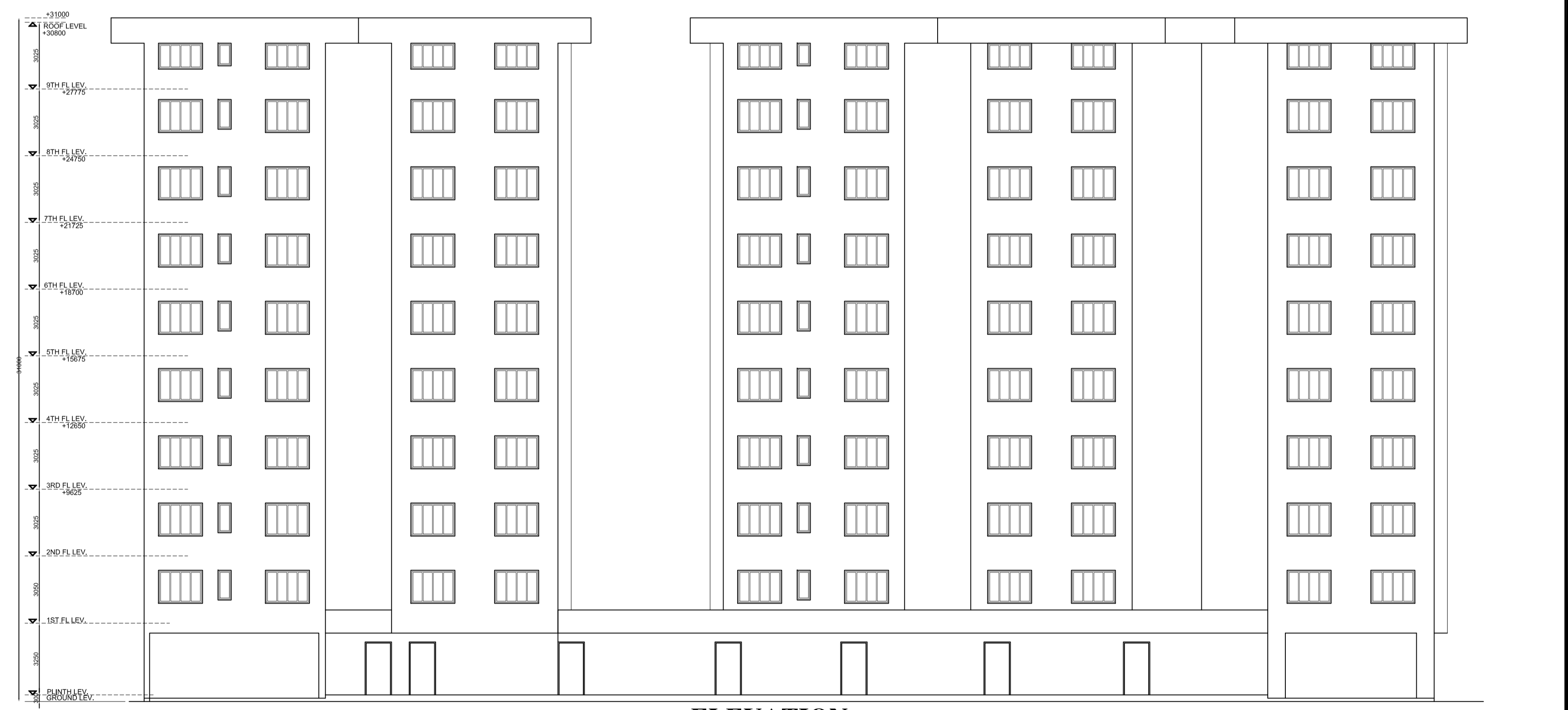
ELEVATION SCALE 1:100