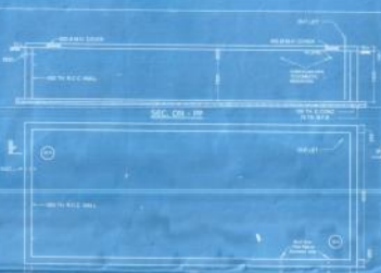
SECTION - 10