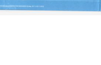
SECTION - 14