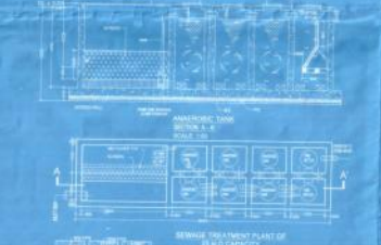
SECTION - 13