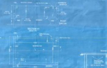
SECTION - 11