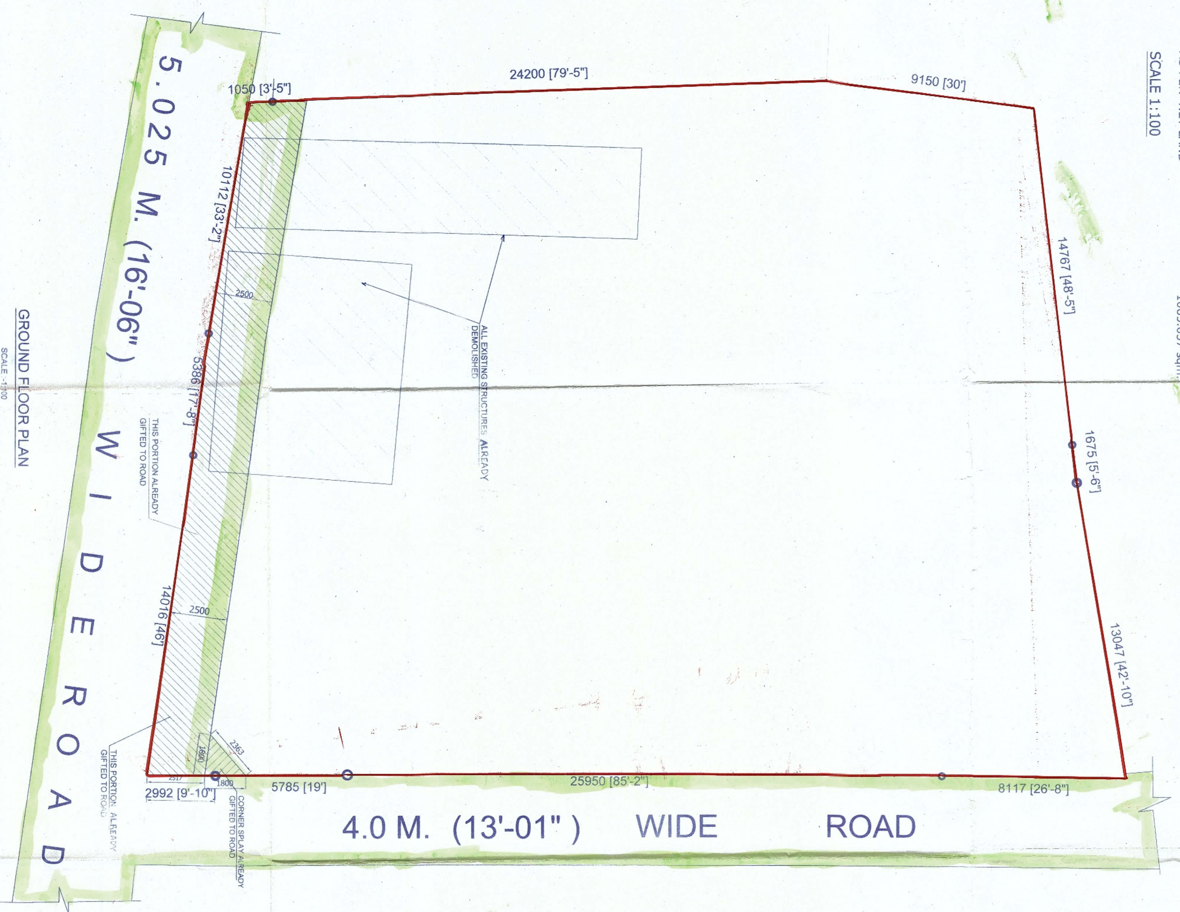
GROUND FLOOR PLAN SCALE - 1:100

LAND AREA : AS PER DEED 17K-1CH- 0 SQFT = 1141.304 SQ.M AS PER PHYSICAL 17K-1CH- 0 SQFT = 1141.304 SQ.M RELEASED AREA (2.5 M. STRIP & CORNER SPLAY ) 75.647 sqm. AS PER NET LAND 1065.657 sqm. SCALE 1:100