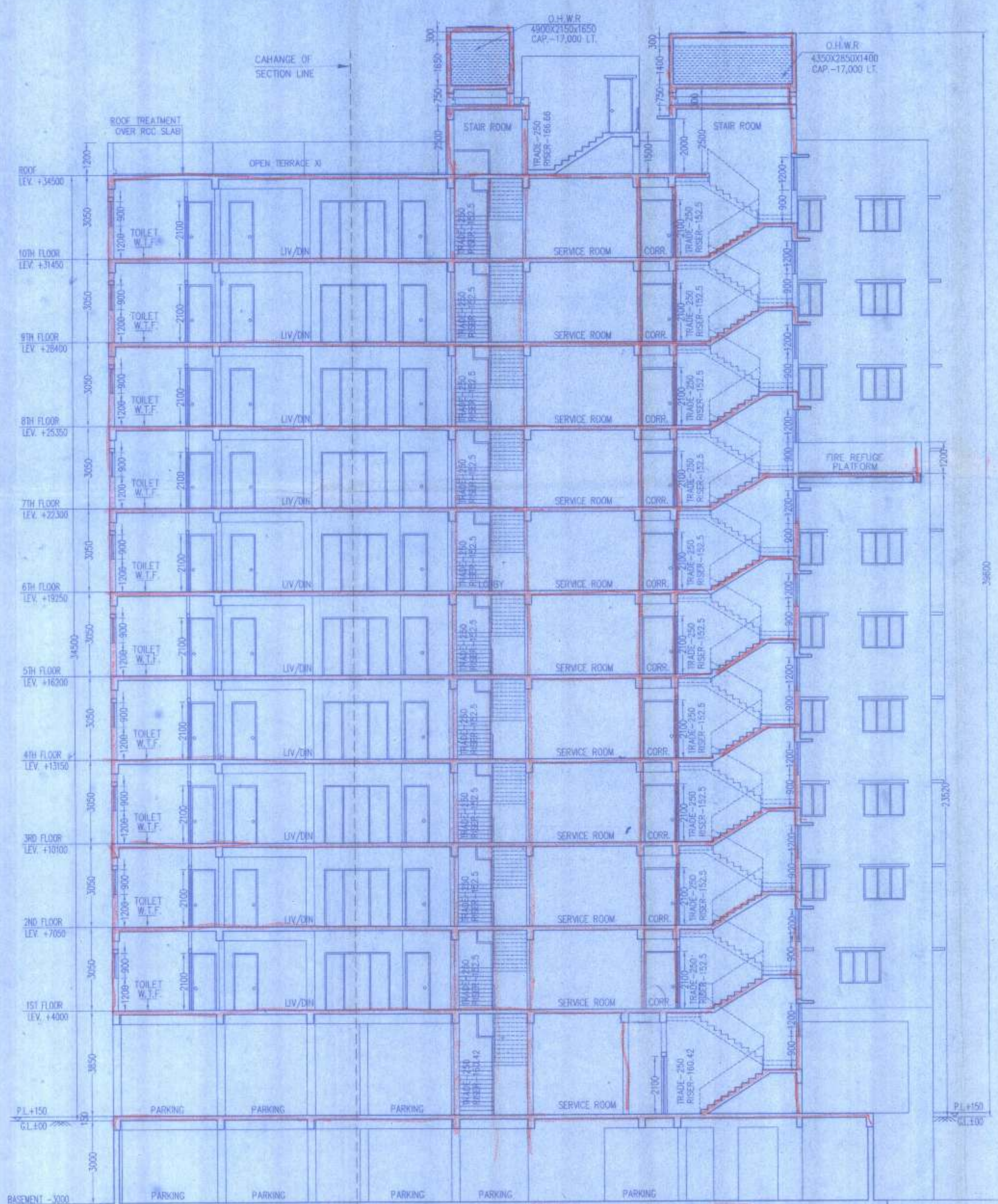
SECTION AT XX SCALE: 1:100