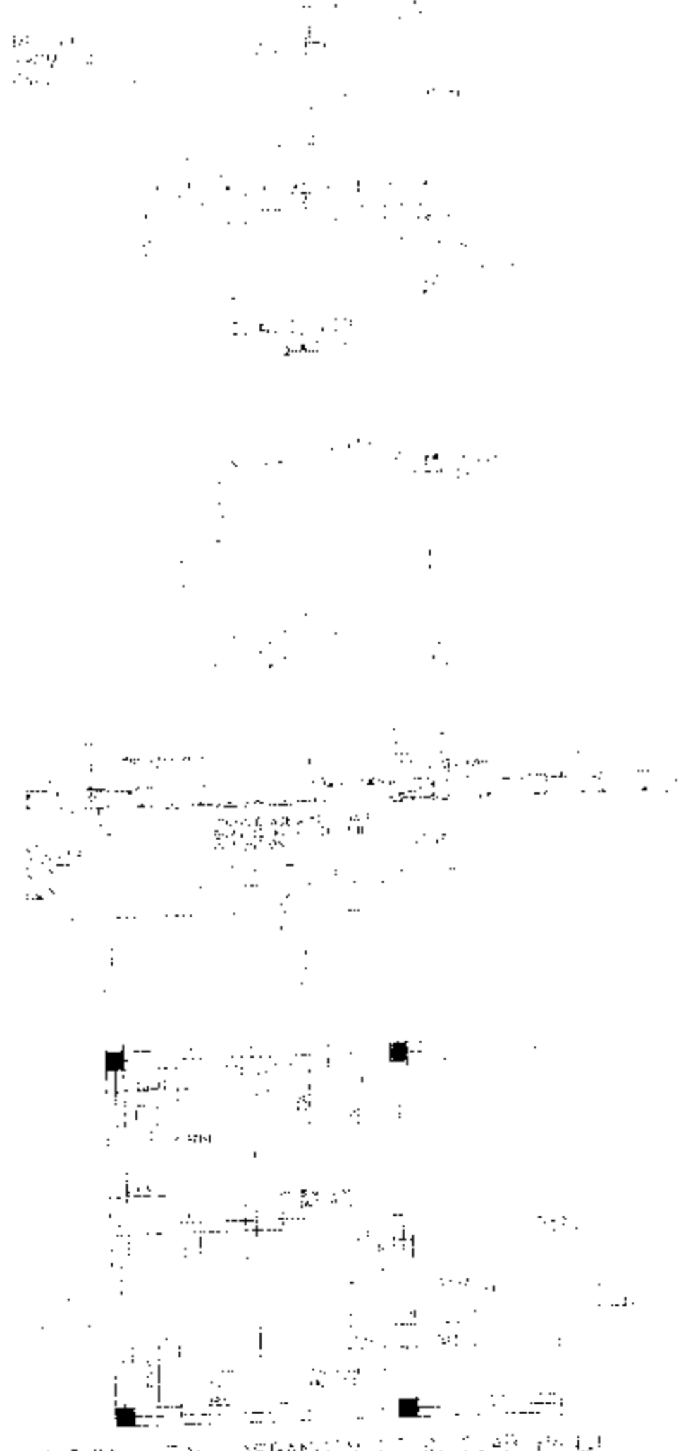
TYPICAL DETAIL OF COLUMN