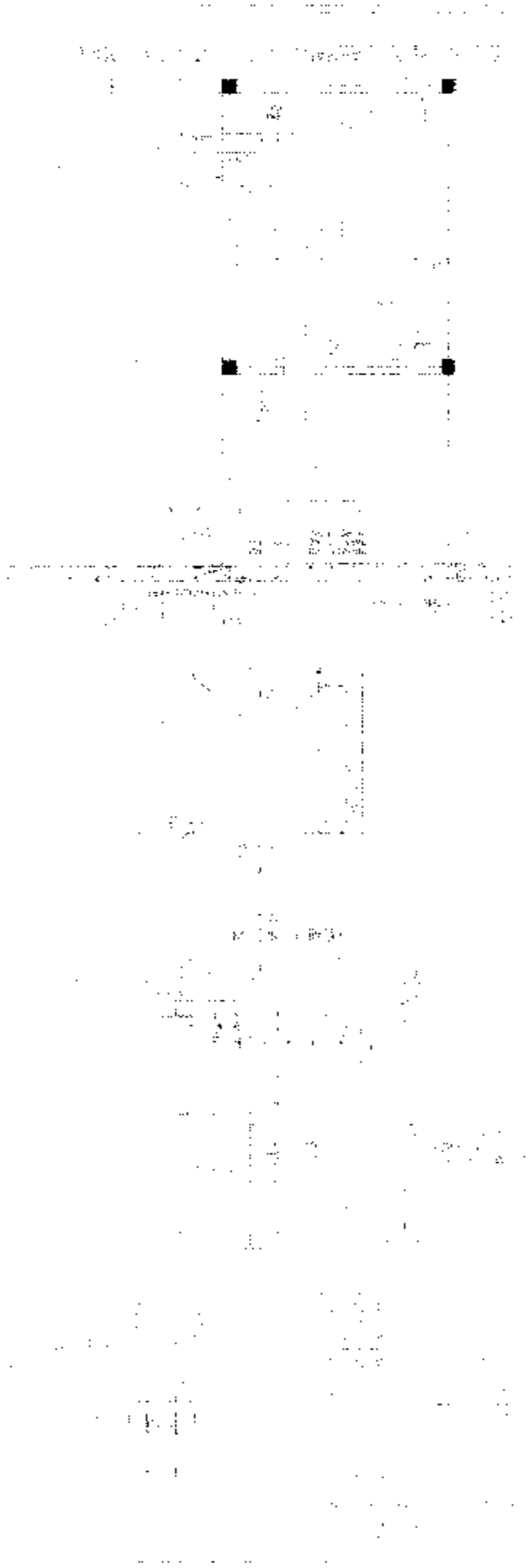
SCHEDULE OF FOOTING