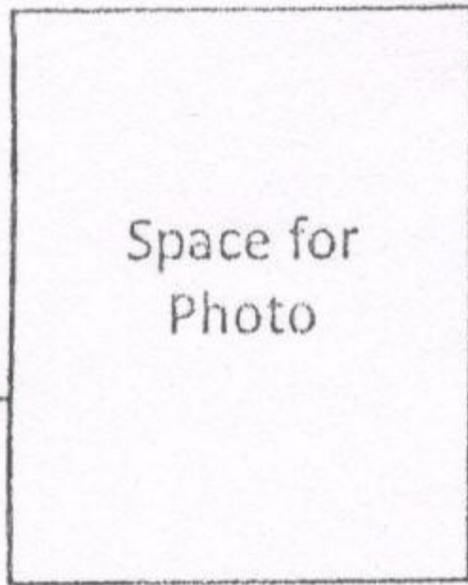
Space for Photo