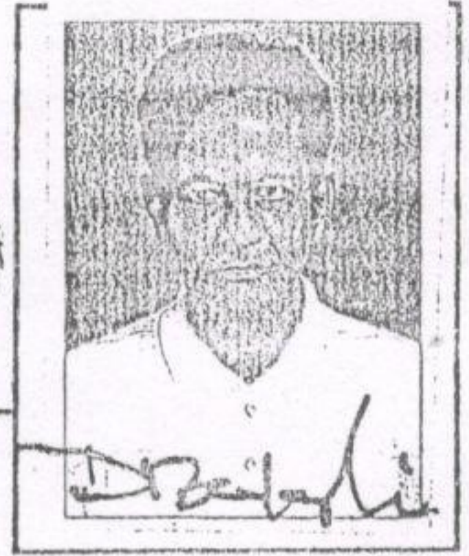
RIGHT HAND FINGER PRINT