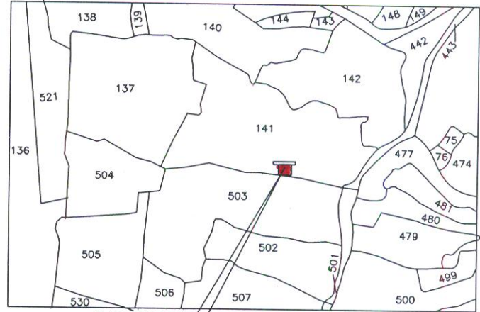
R.S. INDEX MAP (SCALE -1"=330'-0')

LATITUDE - N 23° - 31' - 41.3004" LONGITUDE - E 87° - 21' - 26.5968"