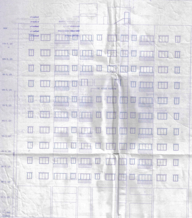
FRONT ELEVATION BLOCK NO. - 12