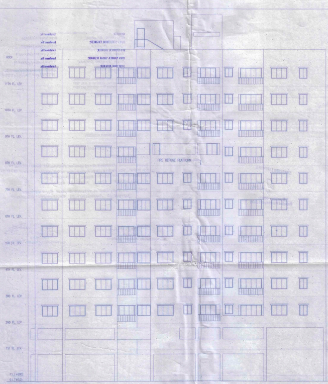
FRONT ELEVATION BLOCK NO. - 13 & 15