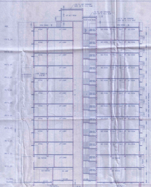
SECTION AT K-K BLOCK NO. 1