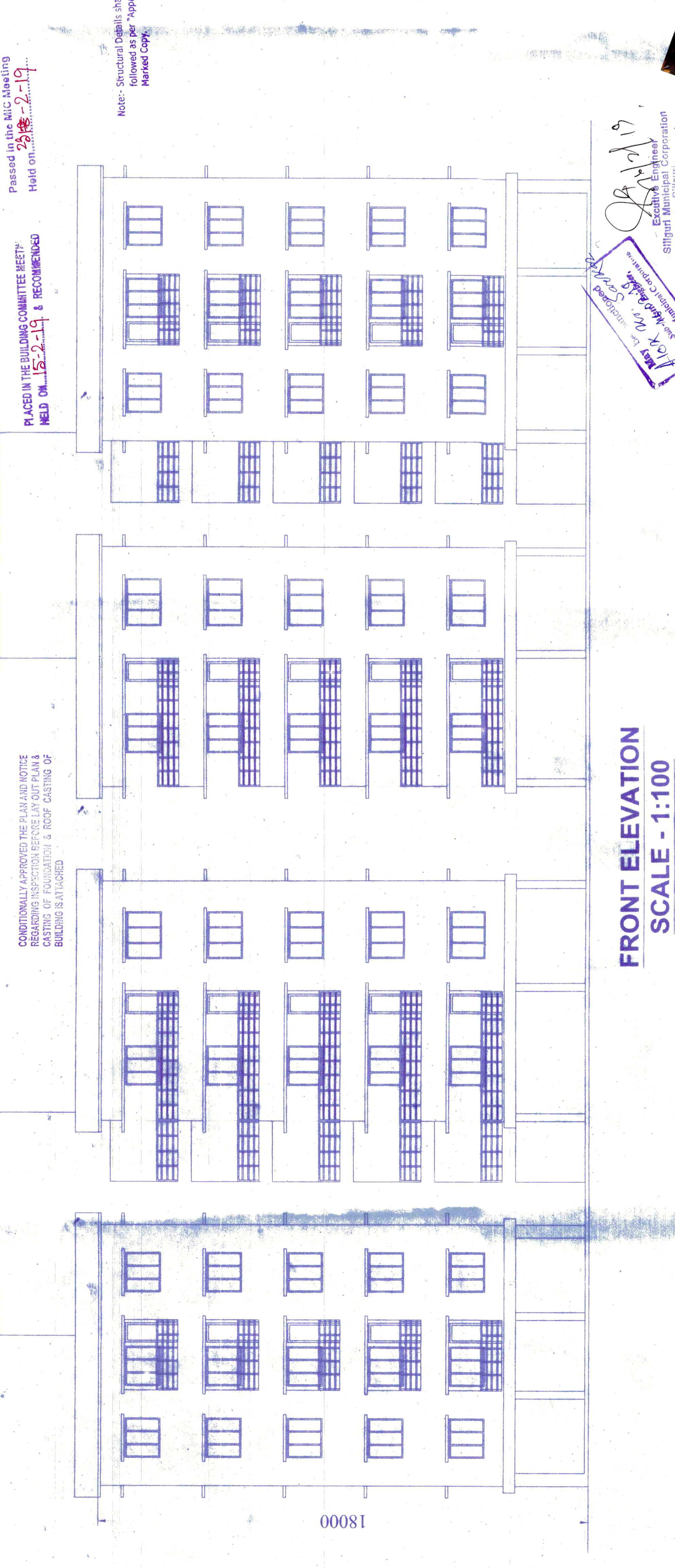
FRONT ELEVATION SCALE - 1:100