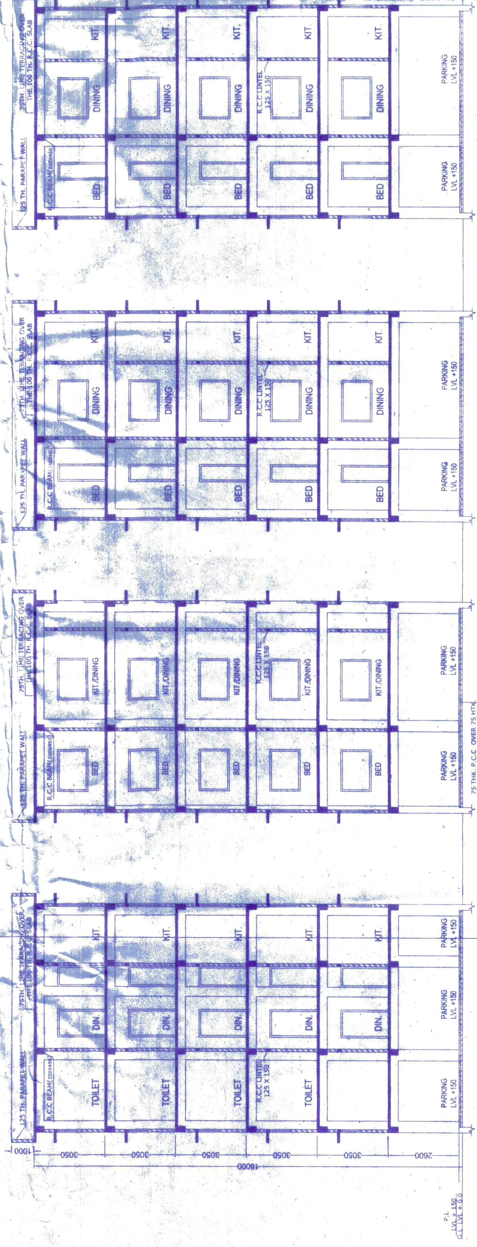
SECTION THROUGH - 'XX' SCALE:-1:100

Valid for Three Years From the Date of 05-2-19 Sanctioned on 05-2-19