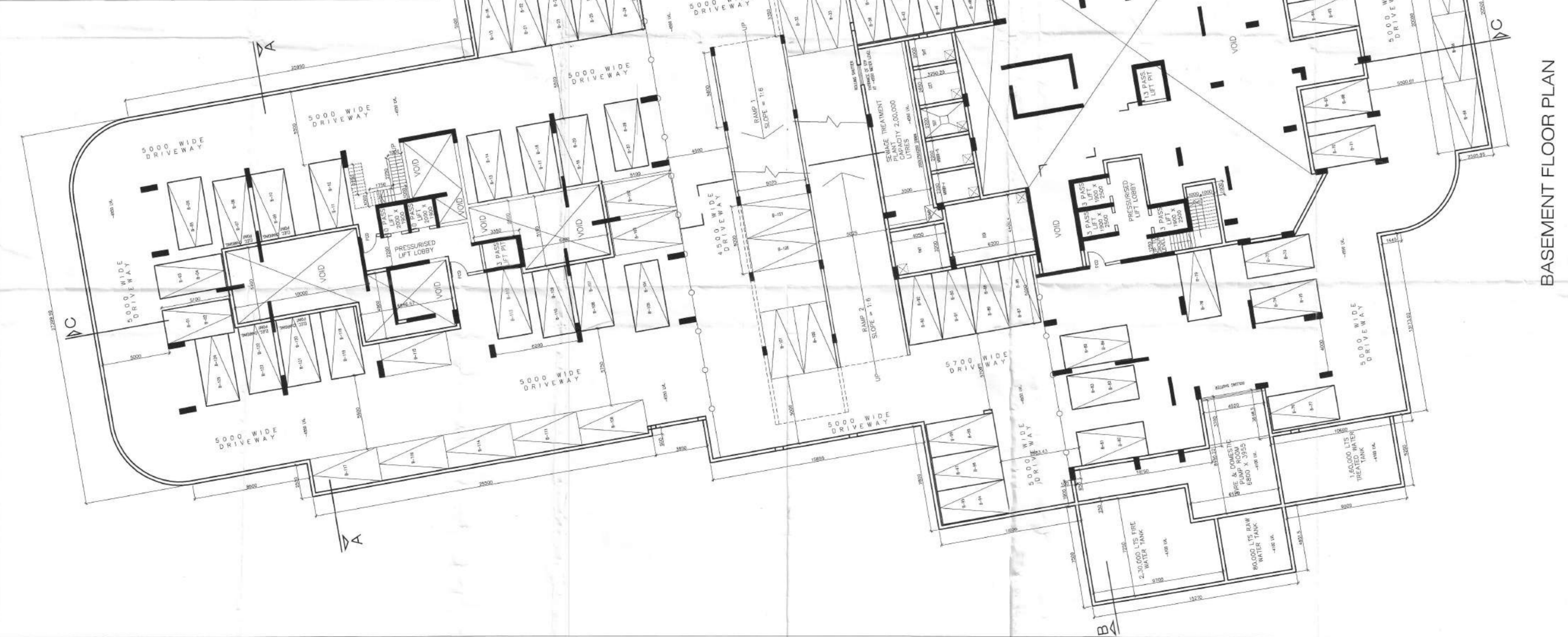
BASEMENT FLOOR PLAN

CERTIFICATE OF GEO-TECHNICAL ENGINEER: I, THE GEO-TECHNICAL ENGINEER, HEREBY CERTIFY THAT THE FOUNDATION DESIGN OF THE BUILDING HAS BEEN DONE BY ME OR UNDER MY SUPERVISION AND TO THE BEST OF MY KNOWLEDGE AND BELIEF IT COMPLIES WITH ALL THE REQUIREMENTS OF THE BUILDING REGULATIONS AND OTHER LAWS AND REGULATIONS APPLICABLE TO THE PROJECT.