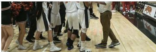
The Way Back