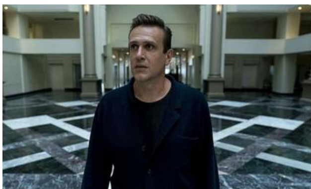
Dispatches from Elsewhere