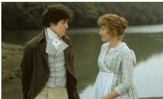
Sense and Sensibility (1995)

Latlong.net is an online geographic tool that can be used to lookup latitude and longitude of a place , and get its coordinates on map. You can search for a place using a city's or town's name, as well as the name of special places, and the correct lat long coordinates will be shown at the bottom of the latitude longitude finder form. At that, the place you found will be displayed with the point marker centered on map. Also the gps coordinates will be displayed below the map.