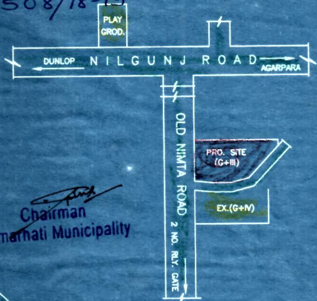
KEY PLAN (NOT TO SCALE)