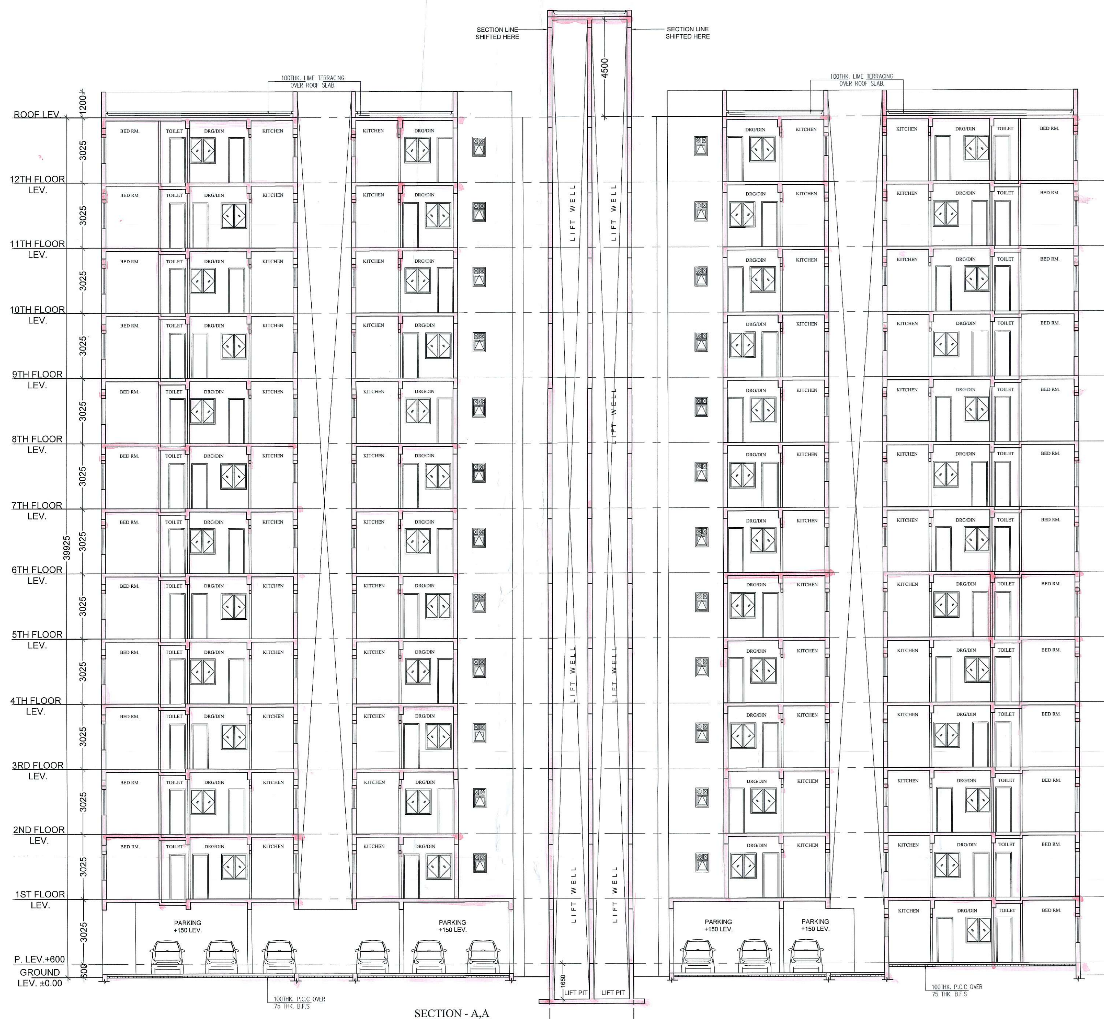
SECTION - A-A