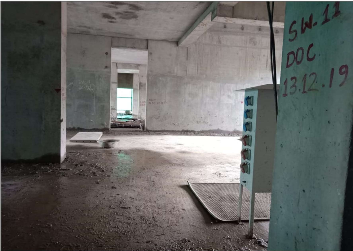
Ground Floor works under progress