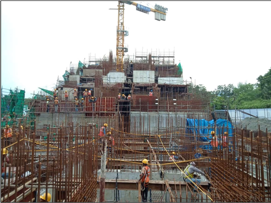
Tower area Raft completed, UGT area wall under progress