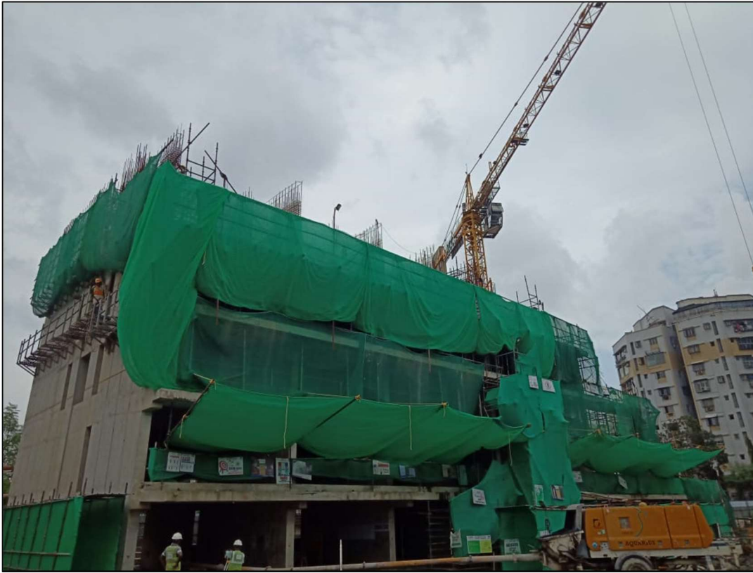
Tower area Shear Walls & Slab under progress