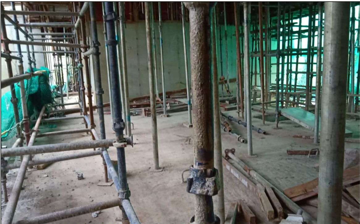
3 rd Floor works under progress