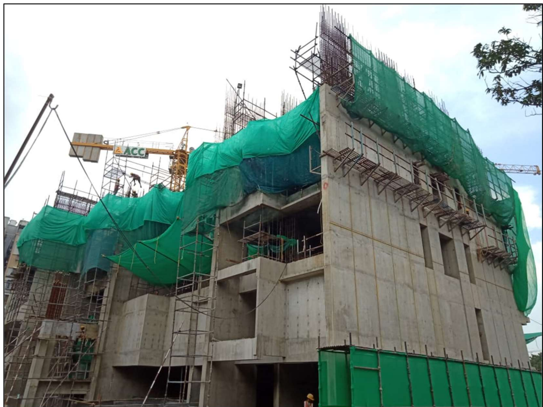
Tower area Shear Walls & Slab under progress