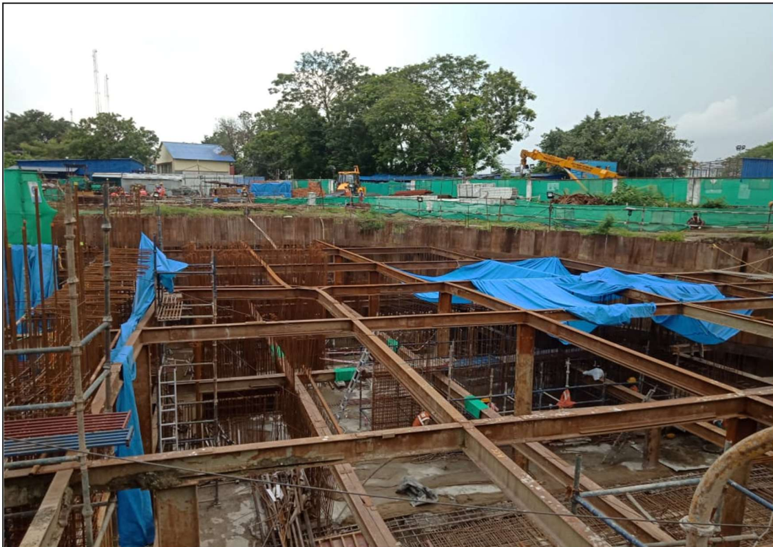
STP Raft works under progress