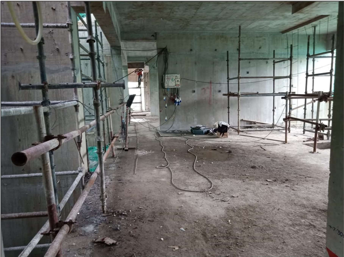
2 nd Floor works under progress