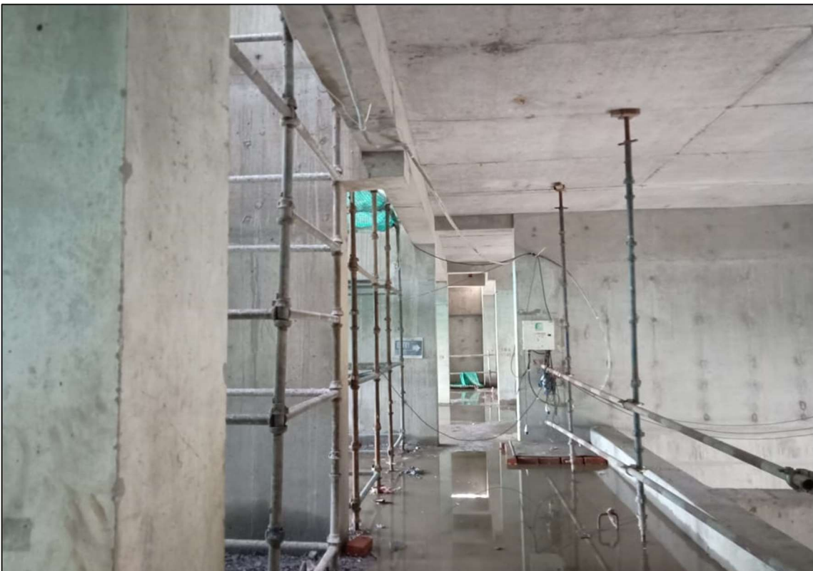
1 st Floor works under progress