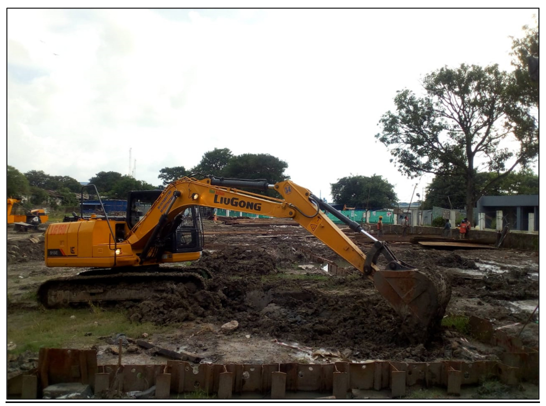
Excavation works under progress