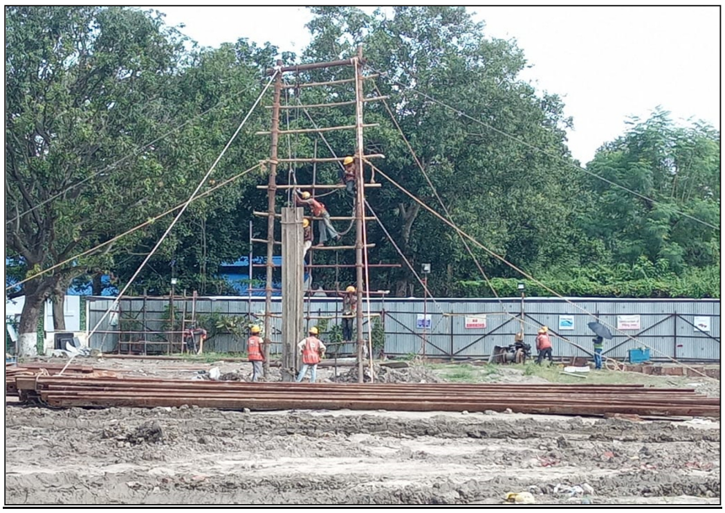
Shoring works (with ISMB 300 & 6 mm plate) completed