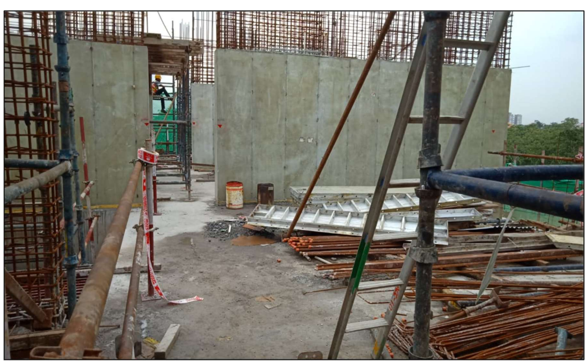
4<sup>th</sup> Floor works under progress