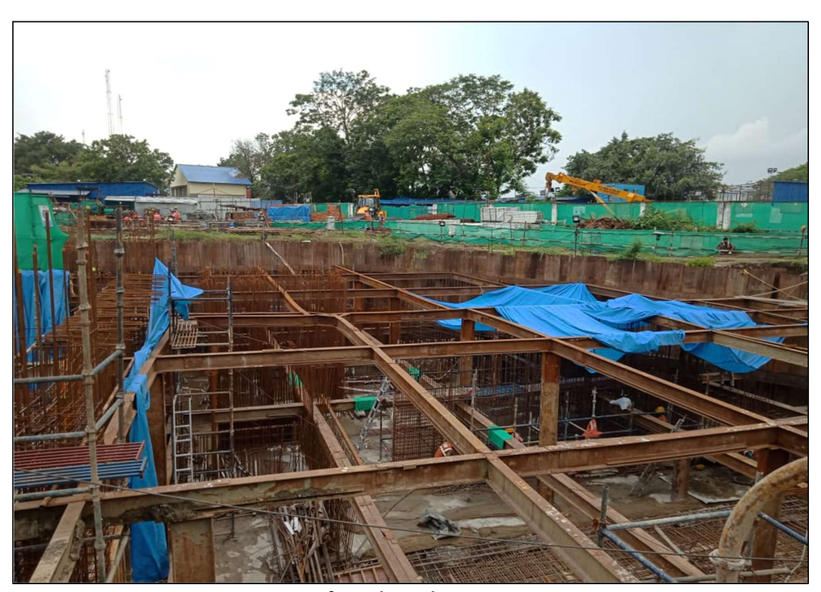
STP Raft works under progress