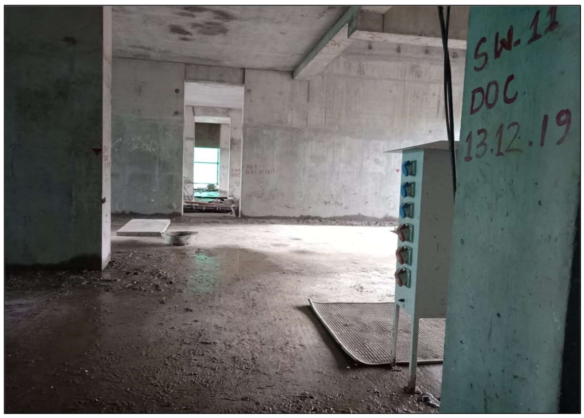
Ground Floor works under progress