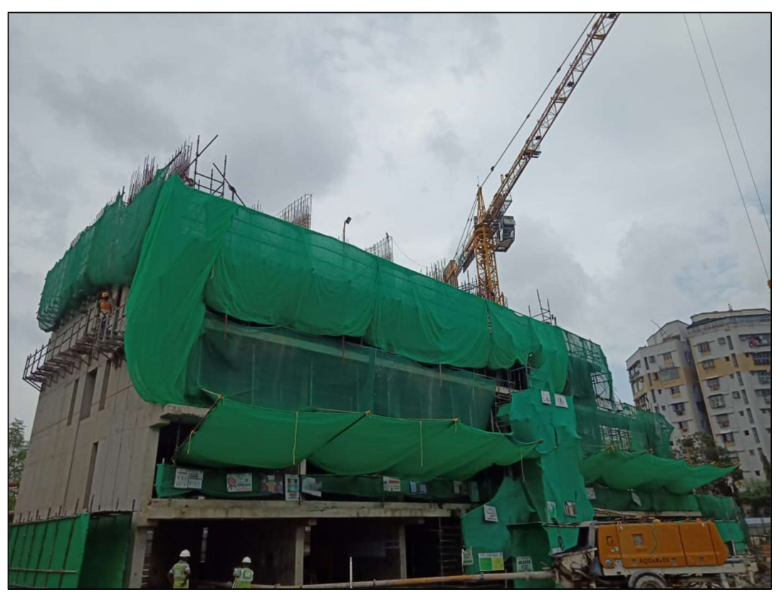
Tower area Shear Walls & Slab under progress