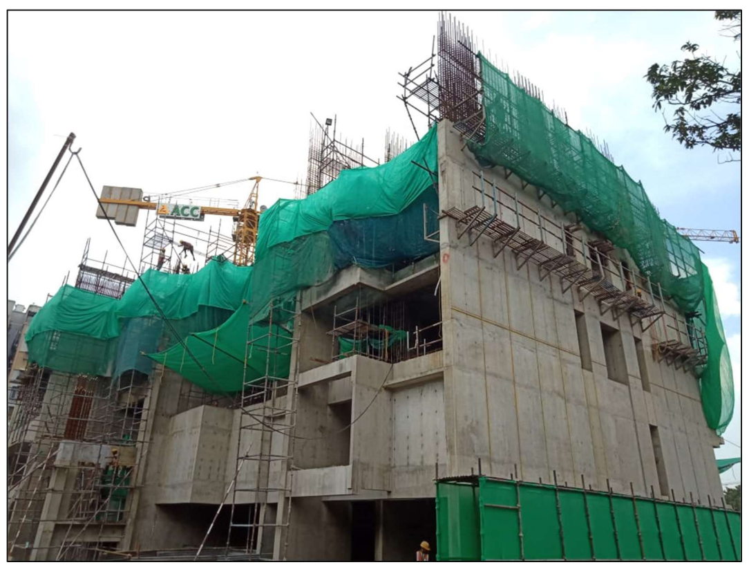
Tower area Shear Walls & Slab under progress